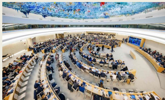
The 112th session of the ILC will be held in Geneva

We, the signatories of this letter, as independent labour