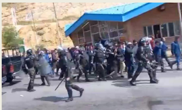
The attack of Iran's repressive agents on the protesting workers of Songon mine in Azerbaijan

... their activities are severely restricted, and many of their founding and other members are either imprisoned or live in constant fear of persecution and long periods of incarceration without trials. It is also a well-known fact that the ruling regime in Iran has been engaged in a continued campaign of repressions, humiliation and threats against women, especially female workers, and intellectuals.