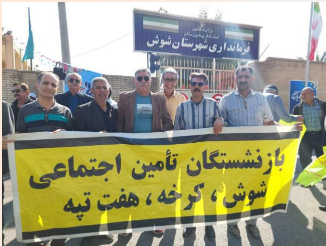
Protest gathering of retirees of Shush, Karkheh and Haft Teshe in front of the governorship